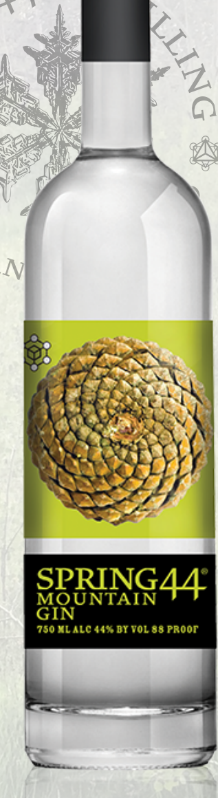
750 ML 44% ABV 88 proof

Distilled from USA-grown, non-GMO corn. Gluten-free. Proudly made in Loveland, CO USA with Rocky Mountain artesian mineral spring water. Follow us at spring44.com